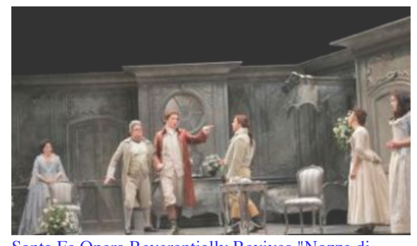
Santa Fe Opera Reverentially Revives "Nozze di Figaro" - June 29, 2013