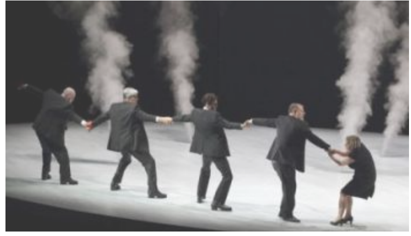
Anticipated Operatic "Double Bills" in Santa Fe and Los Angeles - July-November, 2014