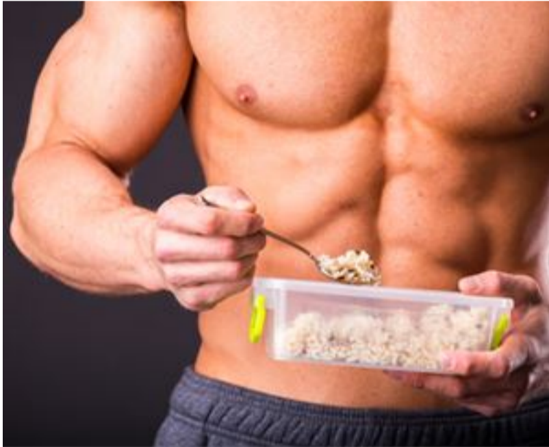
Men: Five Foods That Kill Testosterone and Cause Belly Fat