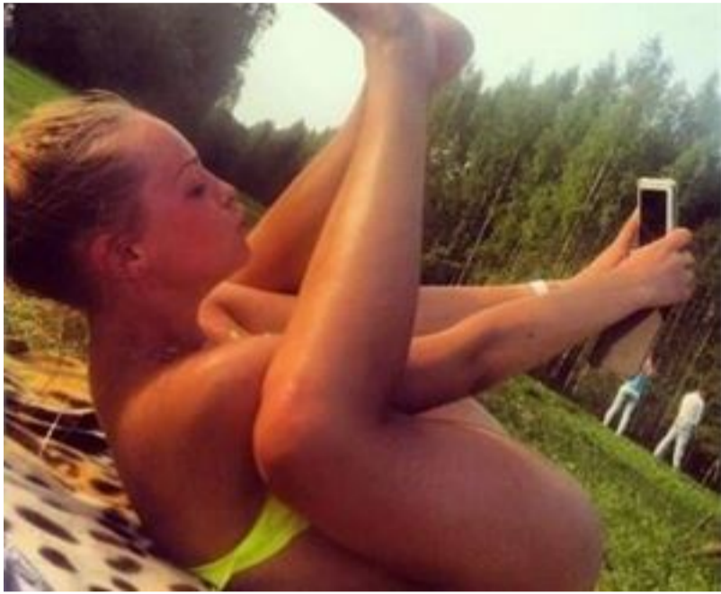
Selfies Gone Horribly Wrong