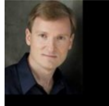
San Francisco Opera Announces Cast Update for THE FALL OF THE HOUSE OF USHER