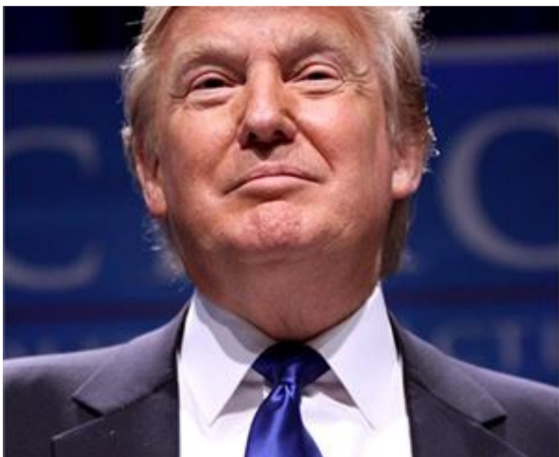
5 Steps to Achieving Financial Freedom - Discover Them Here