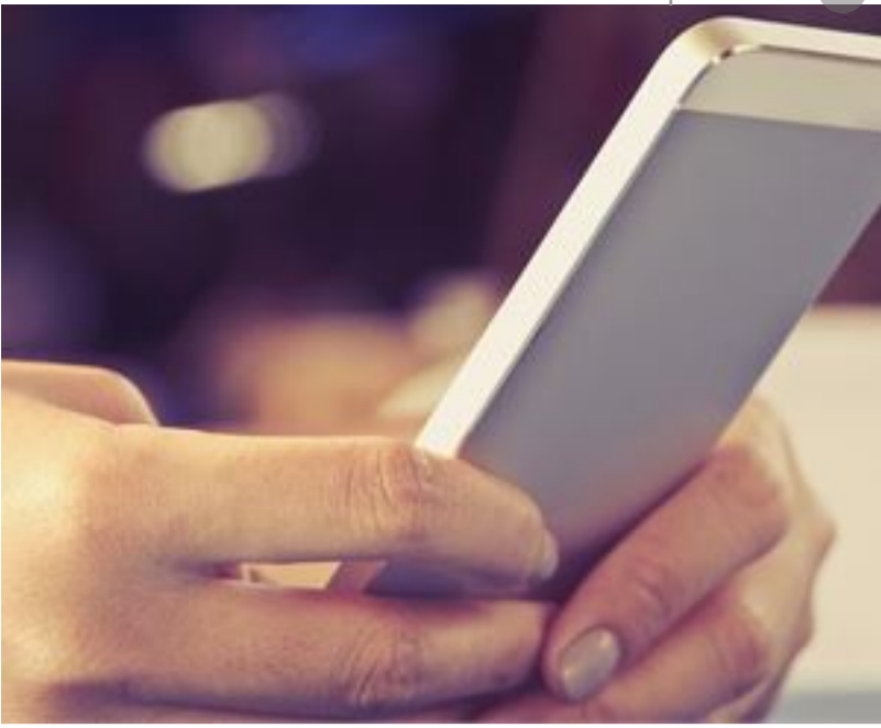
10 Apps You Probably Didn't Know Can Earn You Extra Money