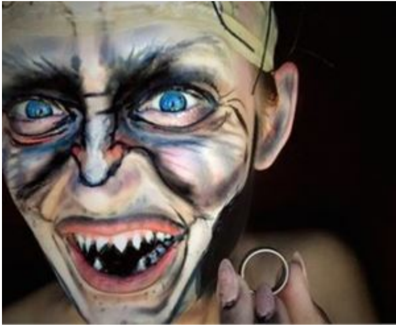
Watch This Insanely Talented Makeup Artist Transform