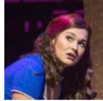
BWW Interview: Olga Peretyatko, the Met's Shimmering Gilda in RIGOLETTO