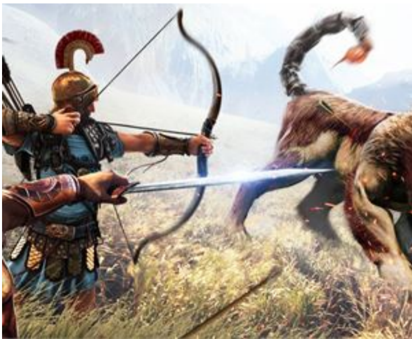
These Ancient Demons May Kill You