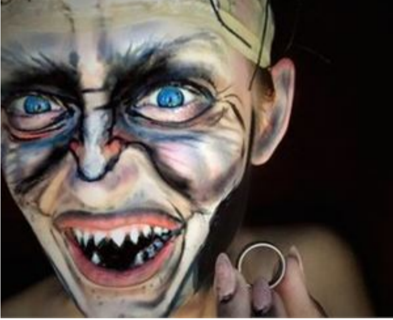
Watch This Insanely Talented Makeup Artist Transform