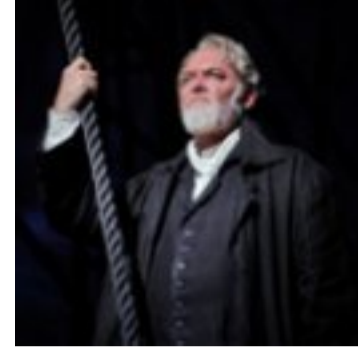
LA Opera Premieres MOBY DICK Tonight