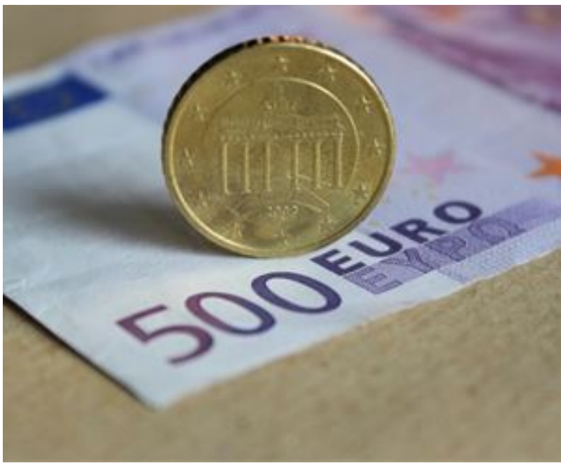
10 Money Mistakes Successful People Don't Make