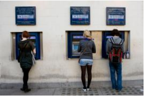
Students: don't suffer financial worries in silence