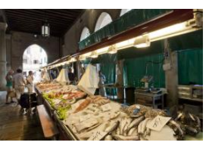
Feeling at home in Venice