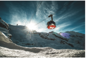
Travel to a skiing sensation