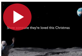
John Lewis Christmas ad 2015: The important message behind the advert