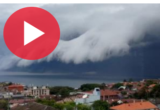
Video shows Bondi Beach 'cloud tsunami' roll into Sydney