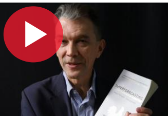
Predicting the future: Why some people are better than others